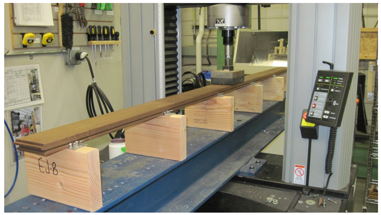
Figure 2.--Test setup showing decking spaced 16 in on-center with a 4- by 6-in. load surface above the end-joint. This sample was attached with clips attached to the joist edge and the decking groove.