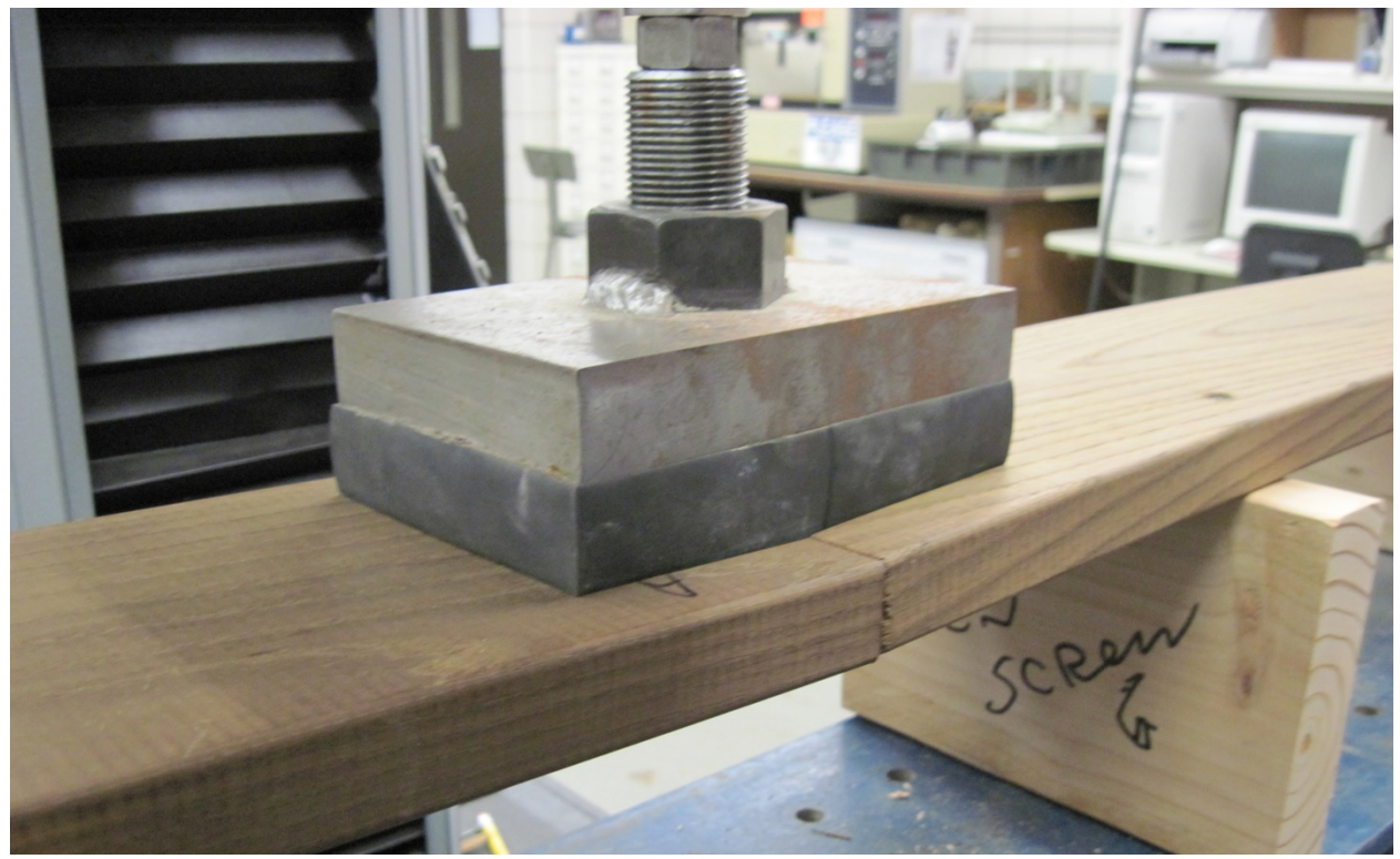
Figure 6.--Control specimen tested with butt joint at midspan.