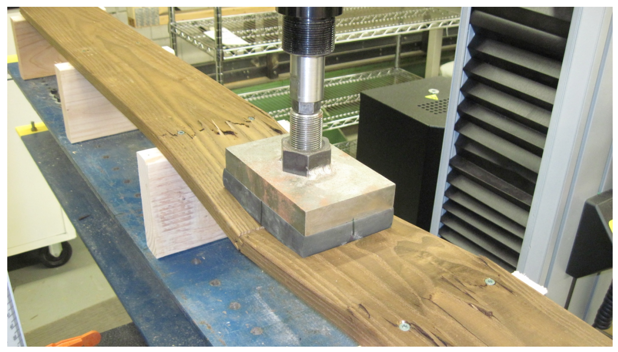
Figure 5.--Typical lumber showing failure mode. This sample was face-screwed to the joist edge.