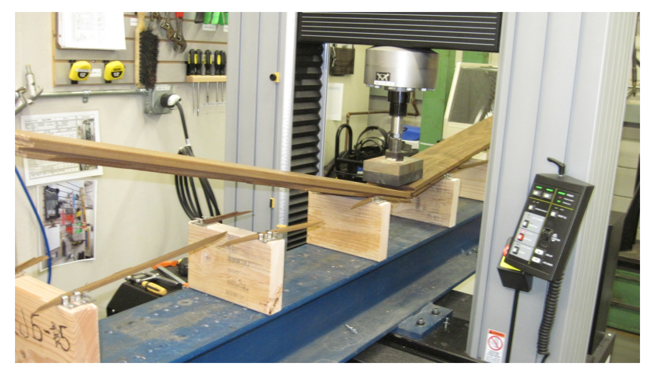
Figure 4.--Typical failure of decking when using clips. The lower tongues fail, resulting in the deck lifting significantly.