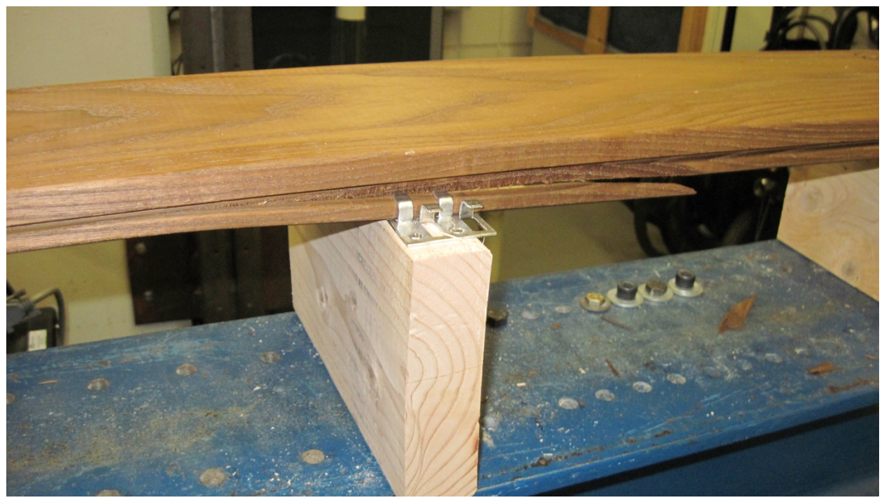
Figure 3.--Typical failure of lower tongue when decking installed with clips.