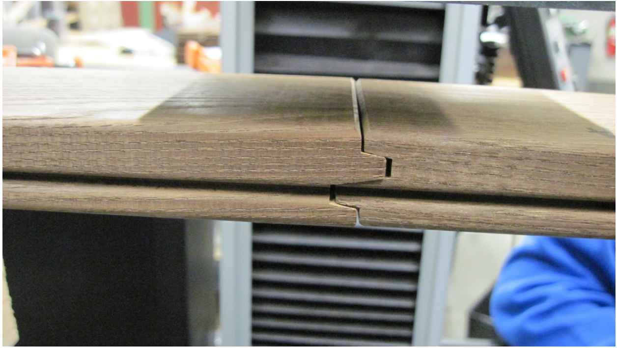
Figure 1.--End-joint tested to evaluate bending characteristics.